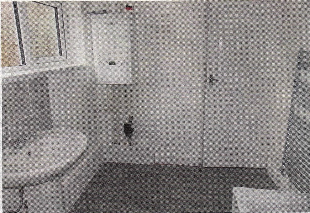
BEFORE AND AFTER: The transformation of a property on Hildyard Street.